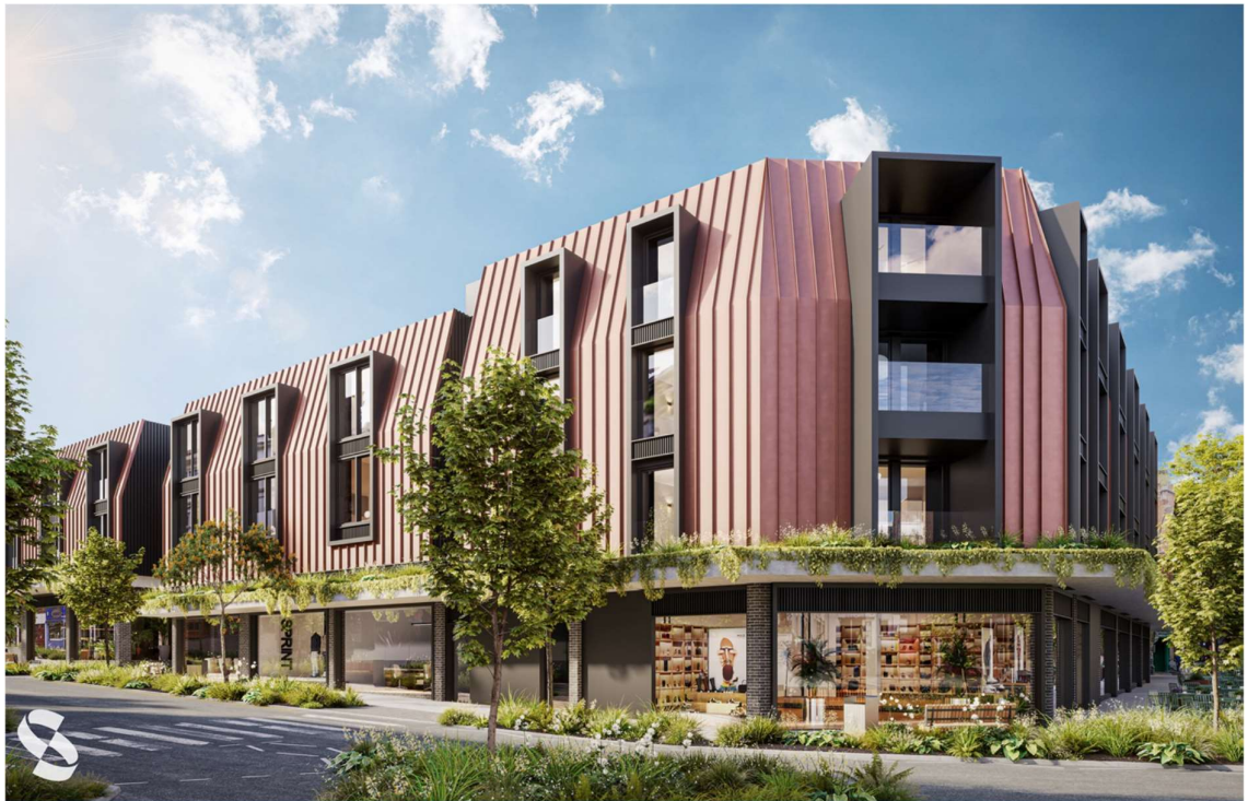
Merrial Street / Red Lion Square