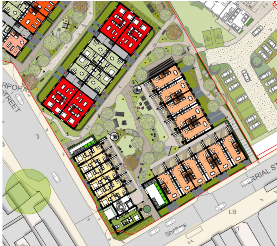
Capital&Centric Residential Development