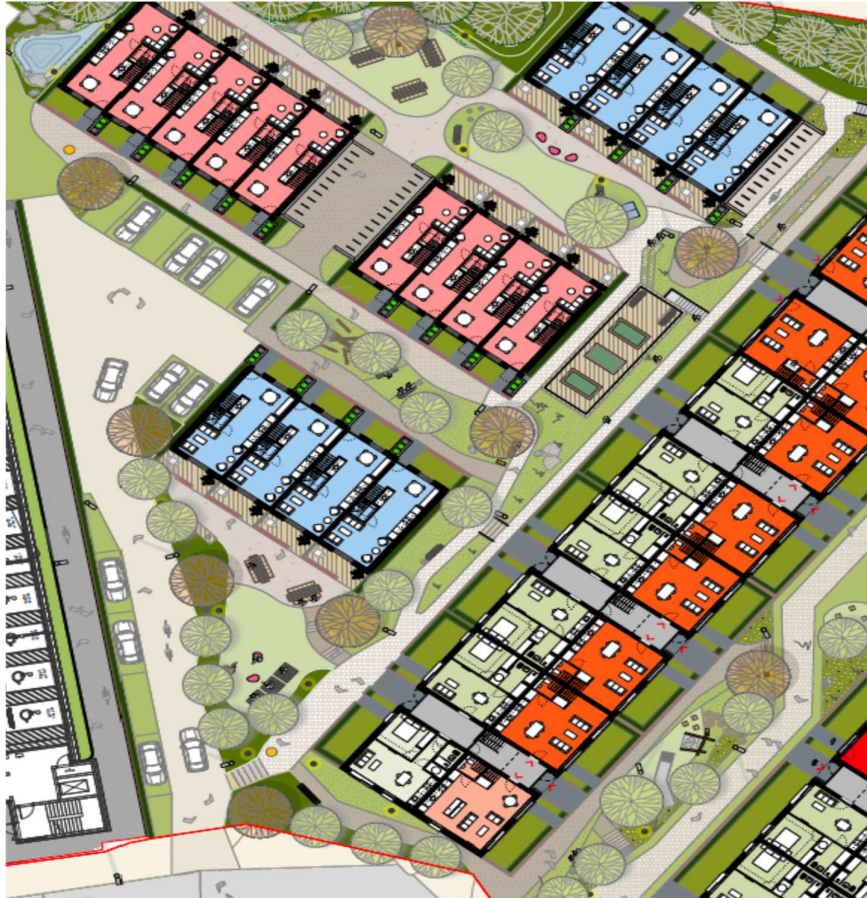
Aspire Residential Development

Aspire have agreed with Capital&Centric a site boundary and the works that will be undertaken to develop out residential units. As with the planning application and RIBA Stage 4, as noted above, the same dates and next steps apply for this development. Capital&Centric will develop this out on behalf of Aspire.